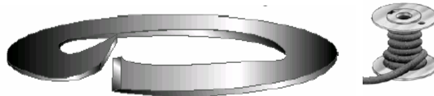
THE HIGH TEMPERATURE GASKET ON A SPOOL.....